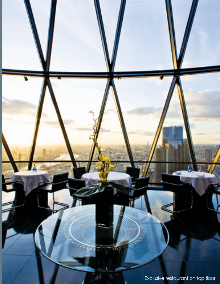
Exclusive restaurant on top floor